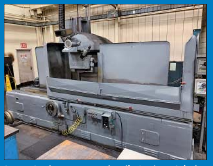
24" x 72" Thompson Hydraulic Surface Grinder