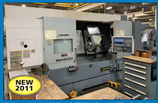
(2) Okuma Multus B400 Six-Axis CNC Turning and Milling Centers