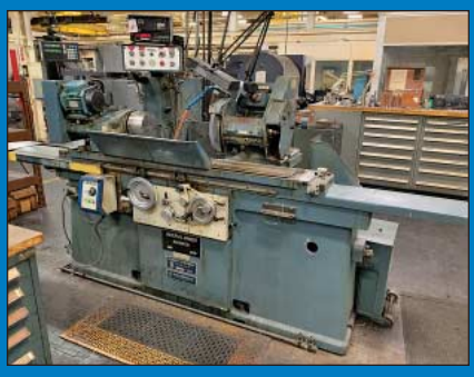
14" x 40" Jones Shipman Model 1307 Universal O.D. Cylindrical Grinder