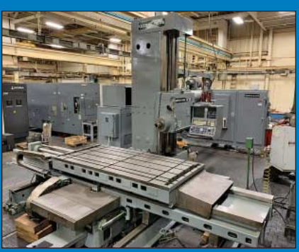
5" Giddings & Lewis Model PC-50 Four-Axis CNC Horizontal Boring Mill