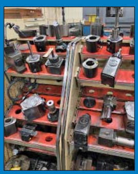
Large Quantity CNC Lathe Tooling