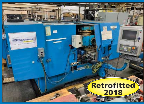
Heald / CNC Eng. Inc. Model Cinternal 2 Five-Axis CNC I.D. Grinder