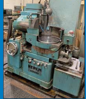
(2) 16" Heald Model 261 Horizontal Spindle Rotary Surface Grinders