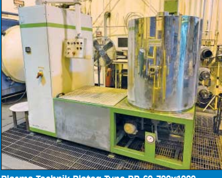
Plasma Technik Plateg Type PP-60-700x1000 Plasma Nitride Coater