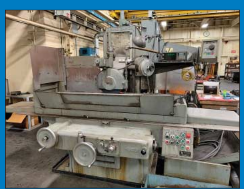
16" x 36" Gallmeyer & Livingston Model 570 Hydraulic Surface Grinder

C.I. Hayes Model VSQD-202436 Vacuum Quench Furnace; s/n 15636, Approx. 20" x 24" x 36" Max., 2,400 Deg. F Max. Temp, Vacuum Nitrogen Atmosphere, 22" x 36" x 4" D Baskets, 500 Lb. Cap., PB Control, 144-KW, See website for details