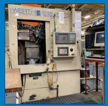
Werth Model 1218S-VNC-T5 CNC Vertical Turning Center