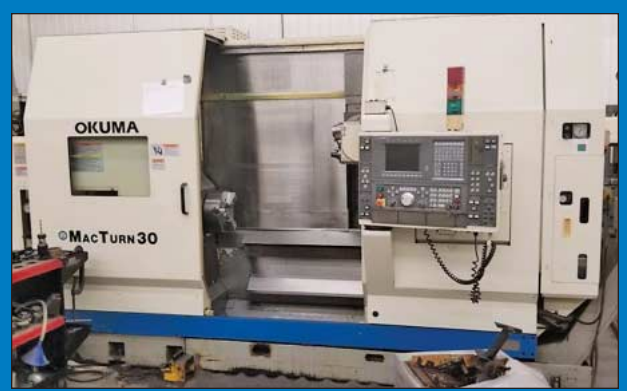
**Okuma Model Macturn-30 Multi-Axis CNC Turning Center