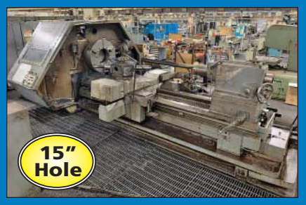
48" x 108" Leblond 15" Hollow Spindle Model 5029 N/C Flat Bed Lathe