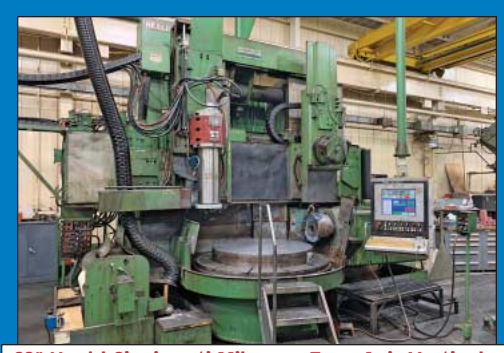
Heald Cincinnati Milacron Four-Axis Vertical Universal CNC Grinder w/ Side Grinding Spindle