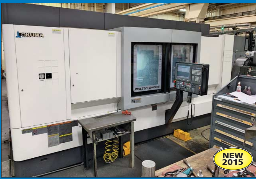
Okuma Model Multus B400II Six-Axis CNC Turning and Milling Center