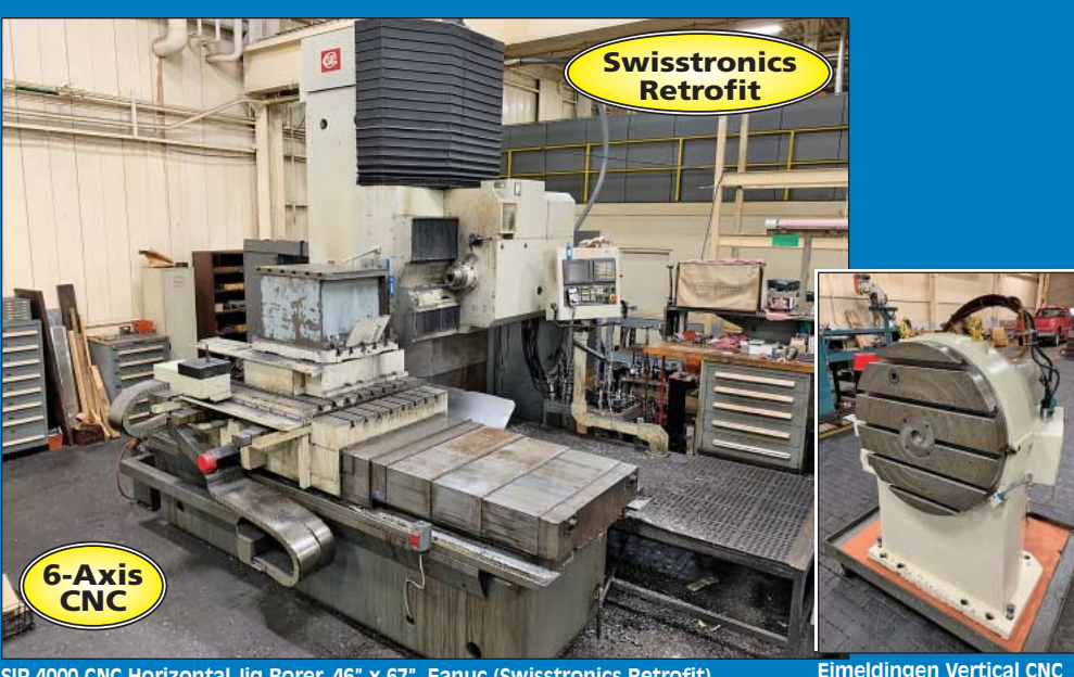
SIP 4000 CNC Horizontal Jig Borer, 46" x 67", Fanuc (Swisstronics Retrofit)