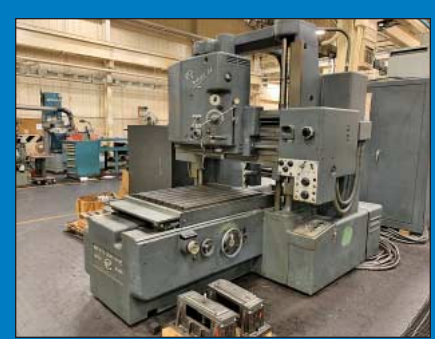
SIP Hydroptic 6A Precision Vertical Jig Borer