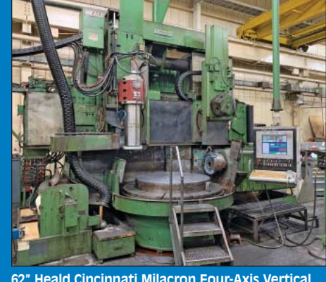
62" Heald Cincinnati Milacron Four-Axis Vertical Universal CNC Grinder w/ Side Grinding Spindle