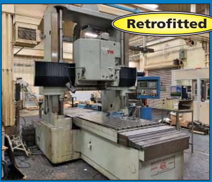
SIP Model 7R High Column CNC Vertical Jig

Machine Accessories; 12" Tsudakoma Model RB300L 4th-Axis Table, 30" Hydraulic Rotary Table, No. 50 Holders, Vises, Angle Plates, Setup Equipment