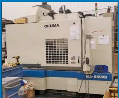
**Okuma Model MA-550VB CNC VMC