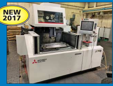
Mitsubishi Model MV2400S Advance Type 3