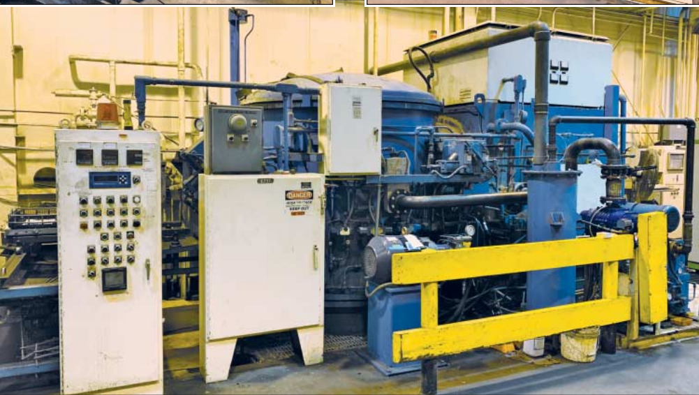
C.I. Hayes Model VSQD-202436 Vacuum Quench Furnace