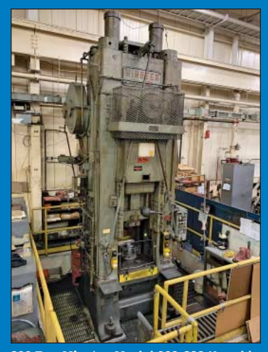
800 Ton Minster Model 900-800 Knuckle Joint Press