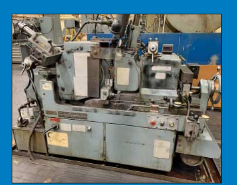
Cincinnati Milacron Model #2-OMV Centerless Grinder