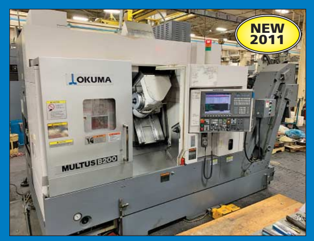
Okuma Multus B200 Six-Axis CNC Turning and Milling Center