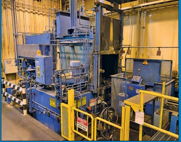
Surface Combustion Model 36-48 Super Prolectric Allcase Natural Gas Fired Quench Furnace