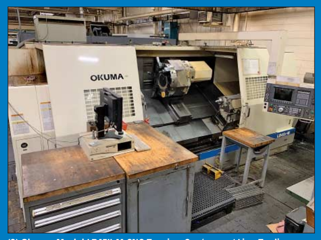
(2) Okuma Model LB45II-M CNC Turning Centers w/ Live Tooling